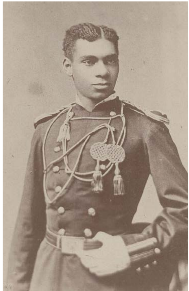
Lt. Henry O. Flipper, the first Black graduate of the U.S. Military Academy at West Point. In 2021, a summit in Texas was renamed “Henry Flipper Hill” after the federal board approved the removal of an offensive term from more than a dozen place names in the state.

By law, the secretary of the interior has joint authority over place names with the U.S. Board on Geographic Names. In practice, however, the board dictates the process. First established by executive order by President Benjamin Harrison in 1890, the board is in charge of developing principles and policies regarding place names; standardizing place names; and making determinations of place names (which are subject to the review and approval by the secretary of the interior).