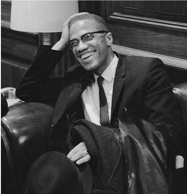
In Maryland, there is a proposal to rename Negro Mountain after Malcolm X, a Black civil rights movement leader.

There are only three terms automatically considered by the board to be offensive and therefore barred from appearing in place names (a recent secretarial order added the third term to the list—see sidebar on page 17). Otherwise, name change proposals that remove offensive or derogatory names receive no special treatment and are handled in the same manner as any other name change proposal.