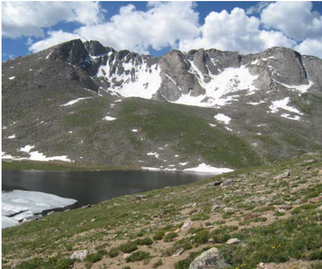
Colorado's Mt. Evans is named to honor former territorial governor John Evans, who facilitated the Sand Creek Massacre. In 2019, the Cheyenne & Arapaho Tribes and The Wilderness Society proposed renaming the peak "Mt. Blue Sky" to honor the Cheyenne and Arapaho people.

It is essential that tribal nations with historic or current connections to geographic features be consulted in naming or renaming those places. This must be done early in the naming process, so that tribal nations can play a lead role if desired and incorporate traditional Native names.