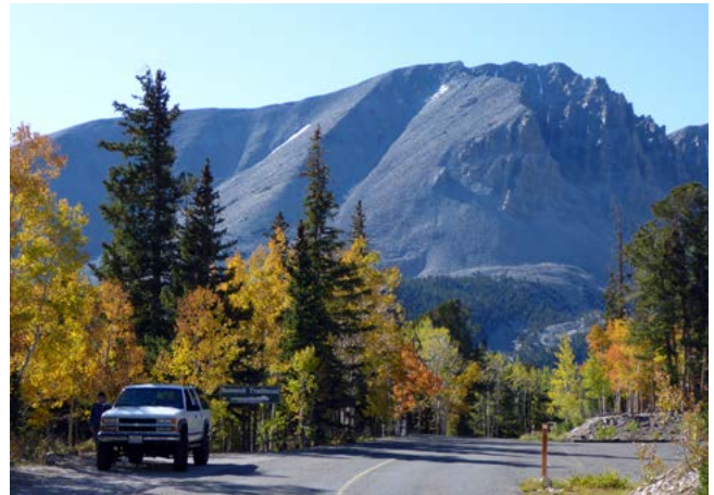
In 2019, Nevada's second tallest mountain was renamed Dosó Doyabi, which means “white mountain” in Shoshone. The previous name, Jeff Davis Peak, honored the segregationist leader of the Confederacy, who declared war on the United States to defend slavery.

The Wall Street Journal identified more than 100 place names on public land that honor Confederate leaders, including Robert E. Lee Creek in Idaho, Stonewall Jackson Lake in Georgia and Jeff [Jefferson] Davis creeks in Montana, California and Oregon. They and other Confederate leaders were responsible for the enslavement of millions of Black people, including accompanying abuse, torture and murder. Davis, the president of the Confederacy, defended slavery and the Civil War until his death, once declaring that “African slavery, as it exists in the United States, is a moral, a social and a political blessing.” In recent years, many Confederate memorials and place names have been reconsidered, and some changed or removed.