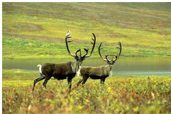
Figure 2: Tundra Environment

Between 12,000 and 10,000 years ago, the glacial lake developed into a shallow pond and vegetated swamp. The result was a complex mixture of microenvironments ranging from open water and marsh to a thickly vegetated shrubby bog that supported cattail and water lily. The Hidden Creek site located near the swamp, dates to around 10,500 years ago and has yielded wetland plant remains consisting of cattail, water plantain, blue flag and water lily. The pollen data from the cedar swamp reflect a more temperate environment with ironwood, oak, walnut or hickory, ash, beech, and chestnut growing nearby.