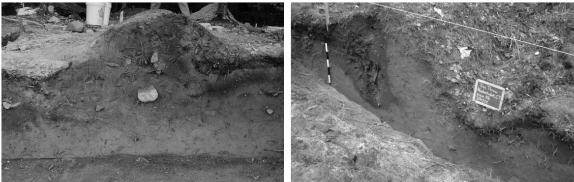
Figure 4: Tree Throws Mashantucket Pequot Reservation

Tree throws are considered to be one of the biggest hazards to archaeological sites on the reservation. A tree throw (aka. tree-fall, tree-tip, windfall, windthrow, uprooting) is the toppling of a tree and coincident uprooting of its root mass which can be caused by any number of internal and external factors (Figures 5 & 6). When a tree throw occurs, a pit is formed on the windward side of the trunk as soil is torn by the rotating root mass to form uplift. External factors that cause tree throws include duration and intensity of wind, soil type, slope and orientation of landform, level of saturation, weight of snow or ice on tree branches, and the falling of adjacent trees (Langohr 1993; Petraglia et al. 2005: 10-5). Weather events commonly associated with tree throws include summer storms and tornadoes, winter storms and Northeasters.