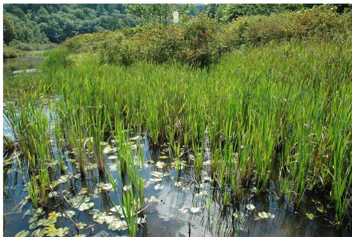
Figure 3: Cattail Swamp

Between 10,000 and 8,000 years ago, the Great Cedar Swamp was characterized by a complex mosaic of environments and was probably at its most productive as indicated by the frequency and complexity of archaeological sites found around the swamp. Terrestrial flora growing around the swamp consisted of pine and oak, with lesser quantities of larch, birch and hemlock, and most importantly hazelnut. Portions of the swamp contained a variety of shrubs and water tolerant trees that provided good cover and browse for both large and small game animals. Most importantly, the swamp was a combination of marshy and open water habitats with a broad range and high density of wetland plants, including cattail and other emergent species such as water lily, arrowhead and pickerel weed.